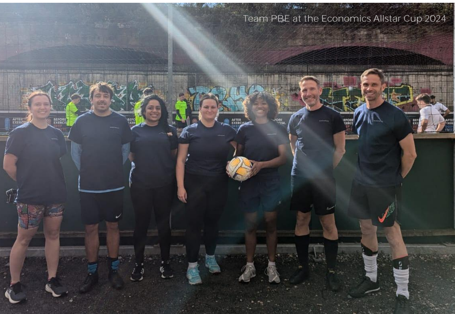
Team PBE at the Economics Allstar Cup 2024

To offer your skills and be first to hear about volunteering opportunities, register to volunteer .